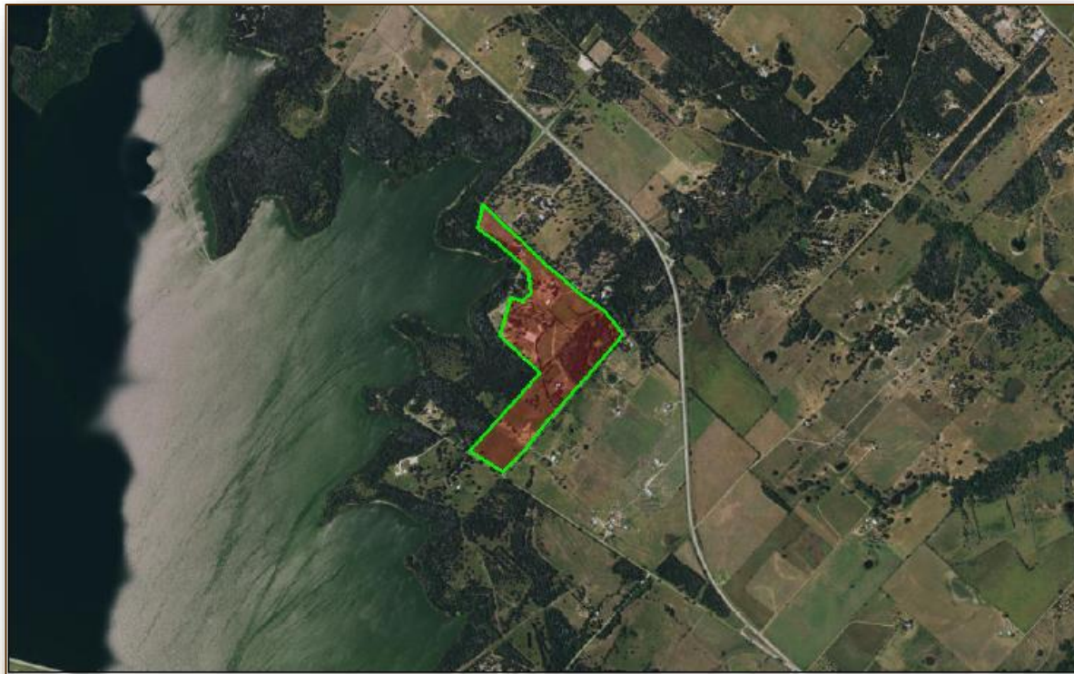
Google Aerial of Property showing the bordering location of Lake Fayette

HAR MLS Number: 68522741 TXLS Number: 92455