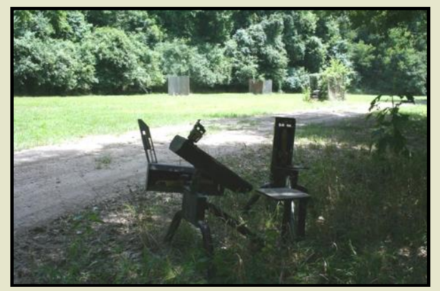
All information contained herein is supplied by sources deemed reliable, but is not guaranteed by Sartain's Heritage Properties, its Brokers or Agents. Properties are subject to errors, omissions, correction, price change, prior sale or withdrawal without notice.