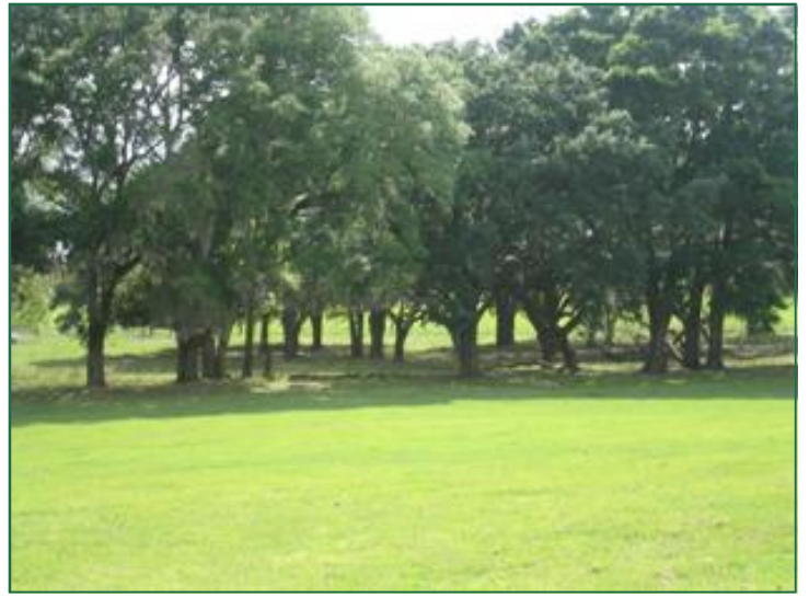
McBride Land & Development, Co.