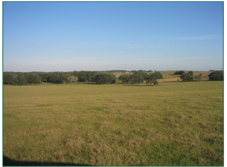
McBride Land & Development, Co.