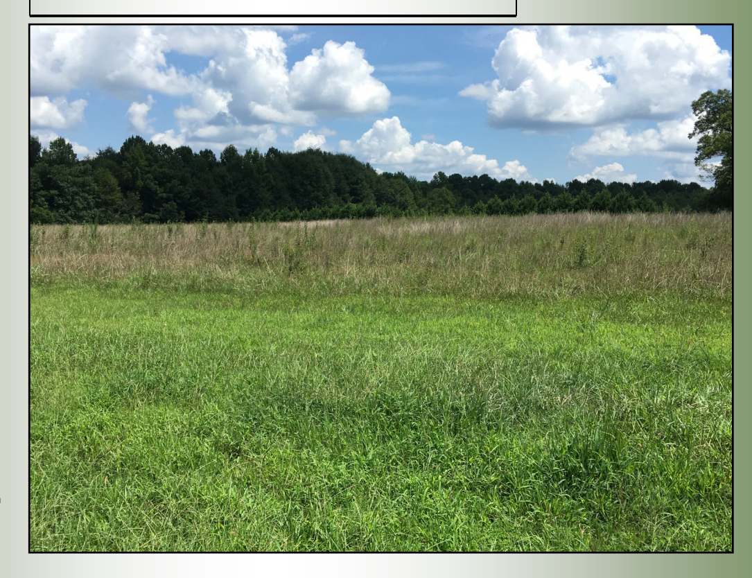
73.21 Acres | Clover Avenue | Madison County, GA | 30629