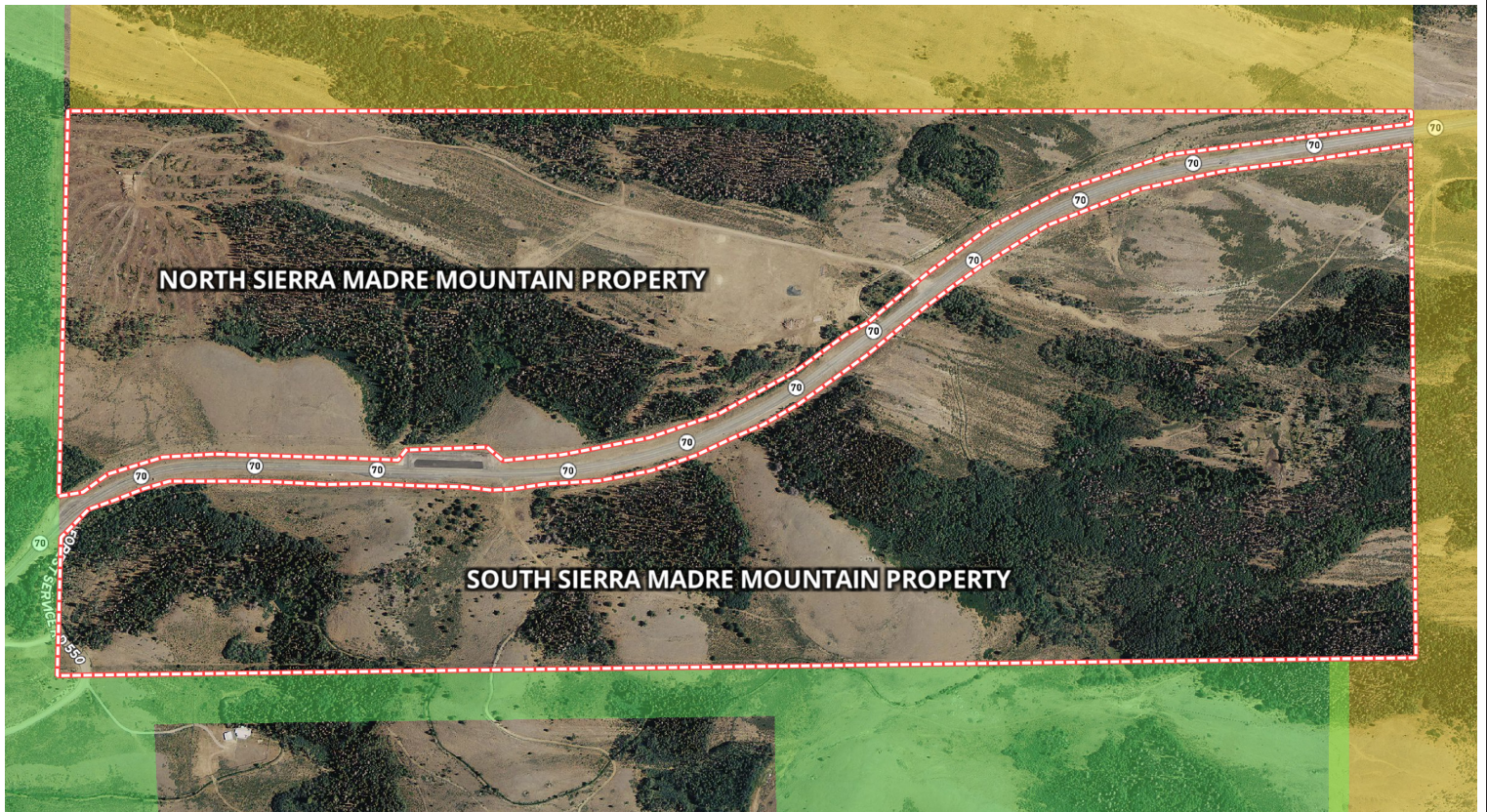
NORTH & SOUTH BREAKOUT OPTION