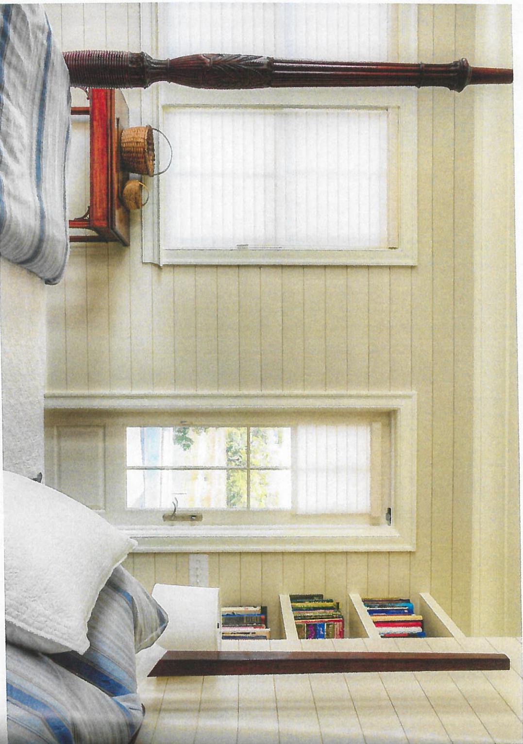
ABOVE: Views of both the creek and a plunge pool off the expansive back porch contribute to the serenity of the master bedroom, where an antique bed original to Charleston has come back home. It wears Belle Epoque matelassé and Sierra Blue Stripe duvet cover and shams. The room's floating bookshelves are designed to bear weight. RIGHT: limestone floor tiles of Lagos Azul ground the angular master bath. The shower's marble bench matches the vanity's marble top. Silhouette shades throughout are by Hunter Douglas. Victoria Albert tub from Ferguson. Chandelier with seaglass-colored pendants from the Michael Mitchell Gallery. Cabinetry by William C. Pritchard.

ing atop the counters to sketch out the curved lines of the range hood, which in final form wears a glazed faux finish.