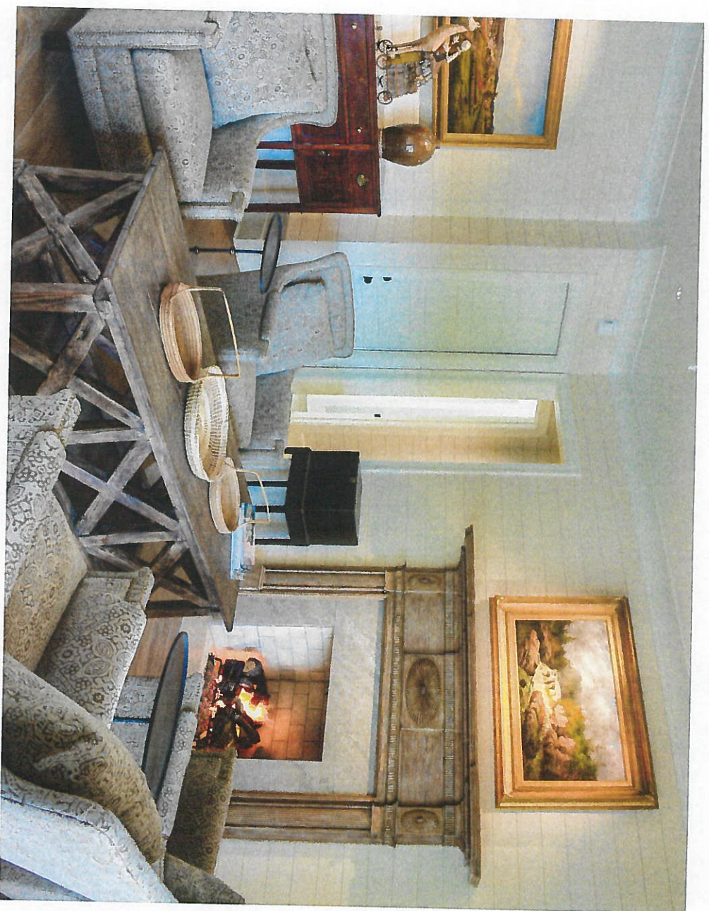
ABOVE: The fireplace mantel sets the home's neutral color palette and rustic style.