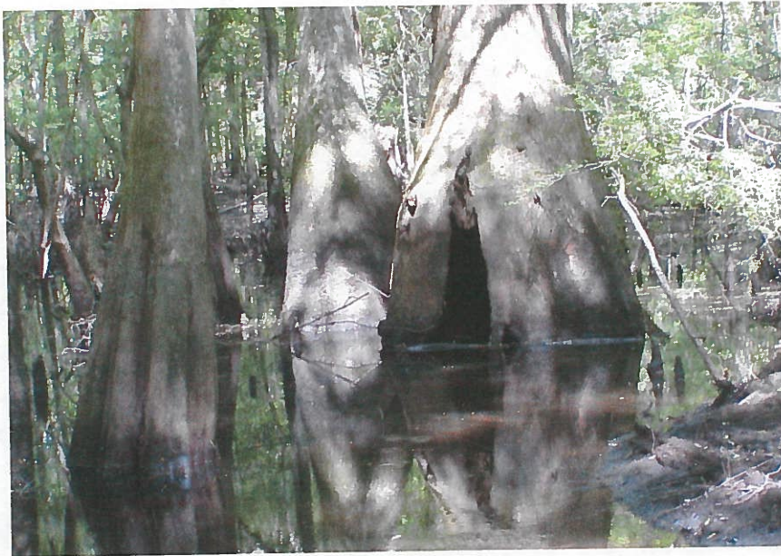
#20. Bald cypress trees in slough near Combahee River; AZ 82