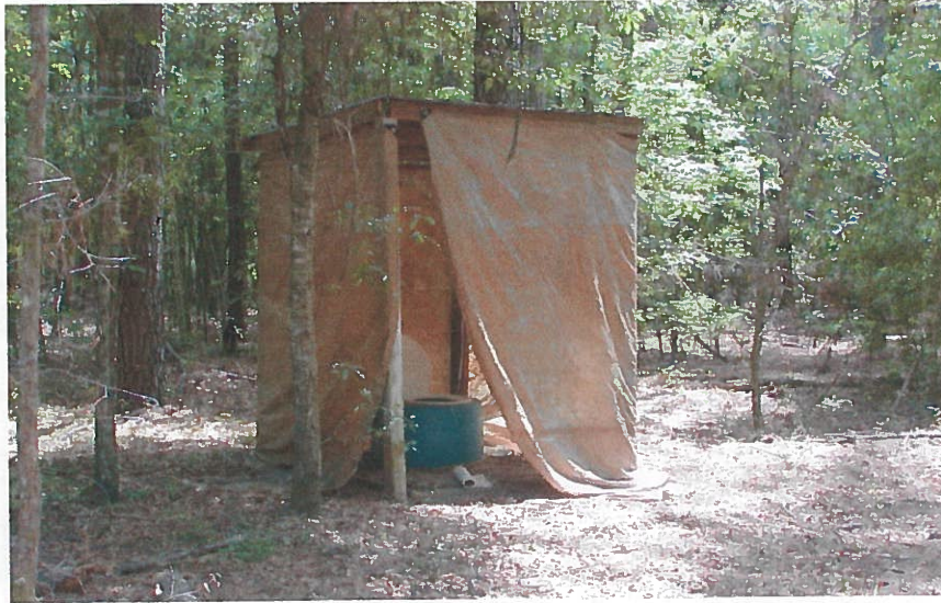
#11. Toilet at camp; AZ 138