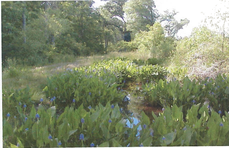
#23. Walk-In stand with pickerelweed in foreground; AZ 330