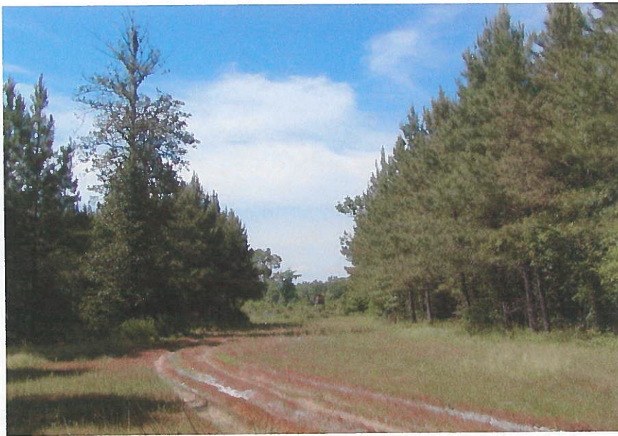
#22. Magnolia Hole wildlife opening; AZ 354