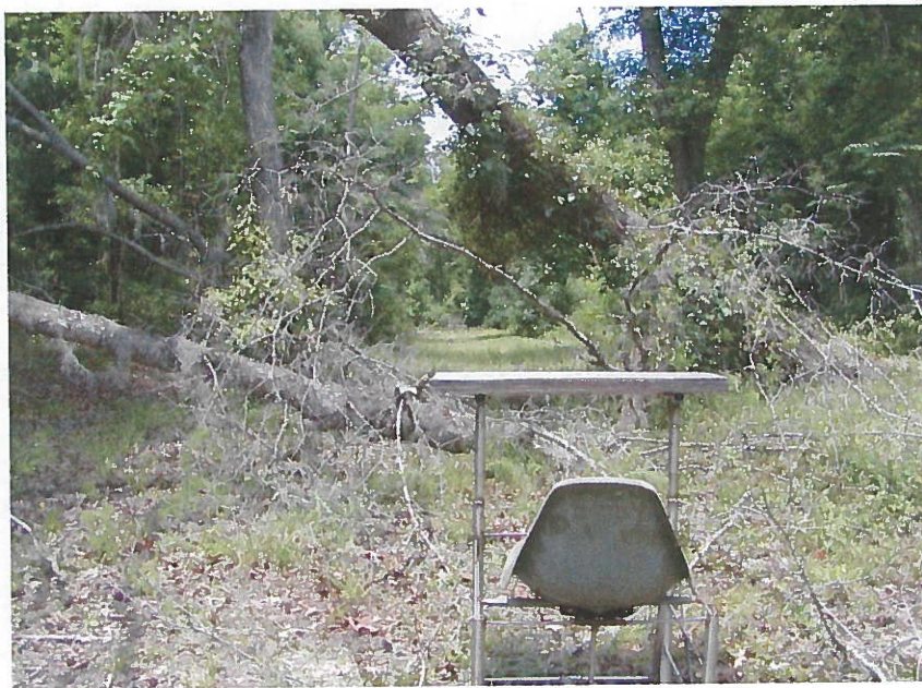
#12. Rifle range; AZ 350