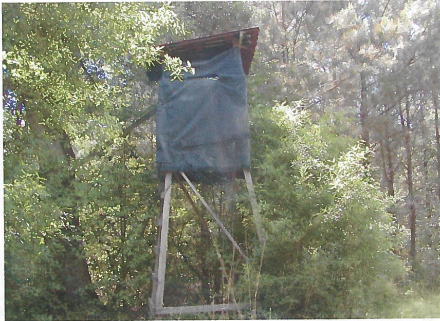
#18. Deer stand in wildlife opening near river; AZ 260 GPS Coordinates: 324474.9/805141.2