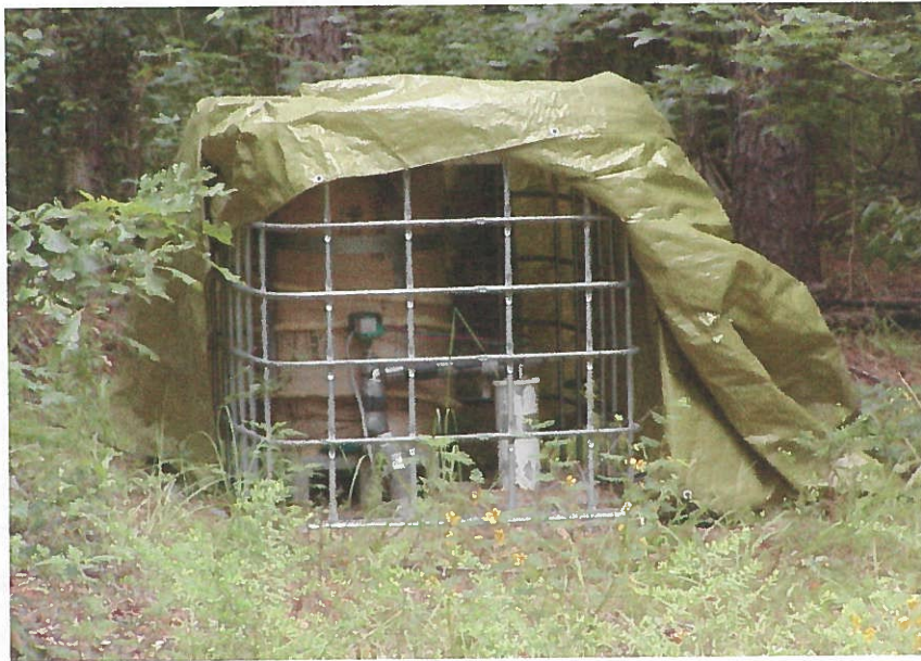
#10. Well at camp; AZ 50