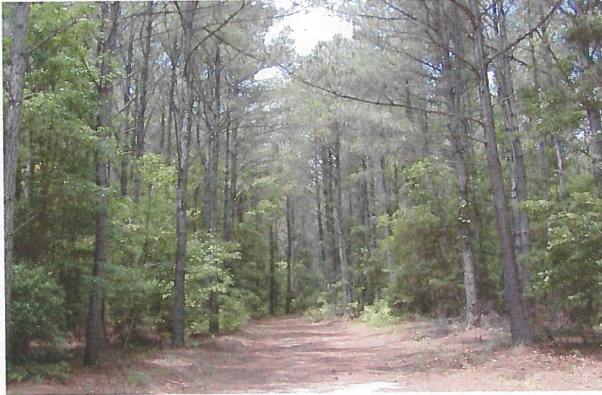
#7. Upland loblolly pines near camp; AZ 320 GPS Coordinates: 324386.9/805252.5