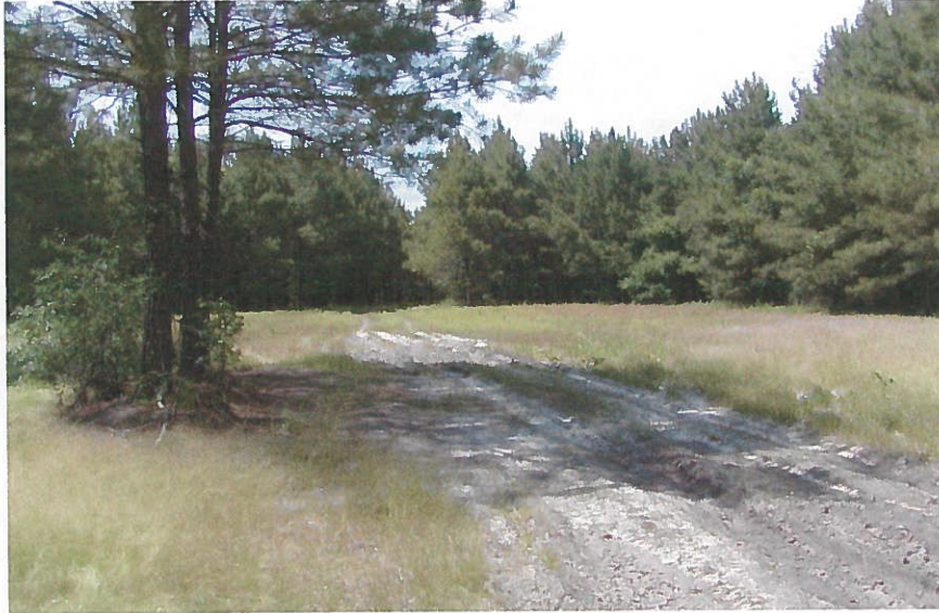
#17. Wildlife opening near river; AZ 340 GPS Coordinates: 324474.9/805141.2