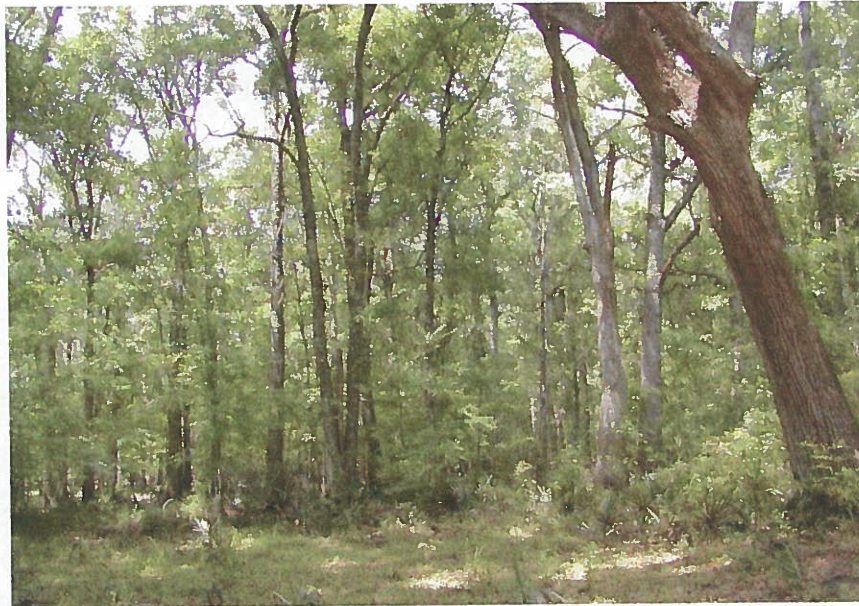
#14. Hardwoods in streamside management zone along Combahee River; AZ 18 GPS Coordinates: 324473.5/805128.4