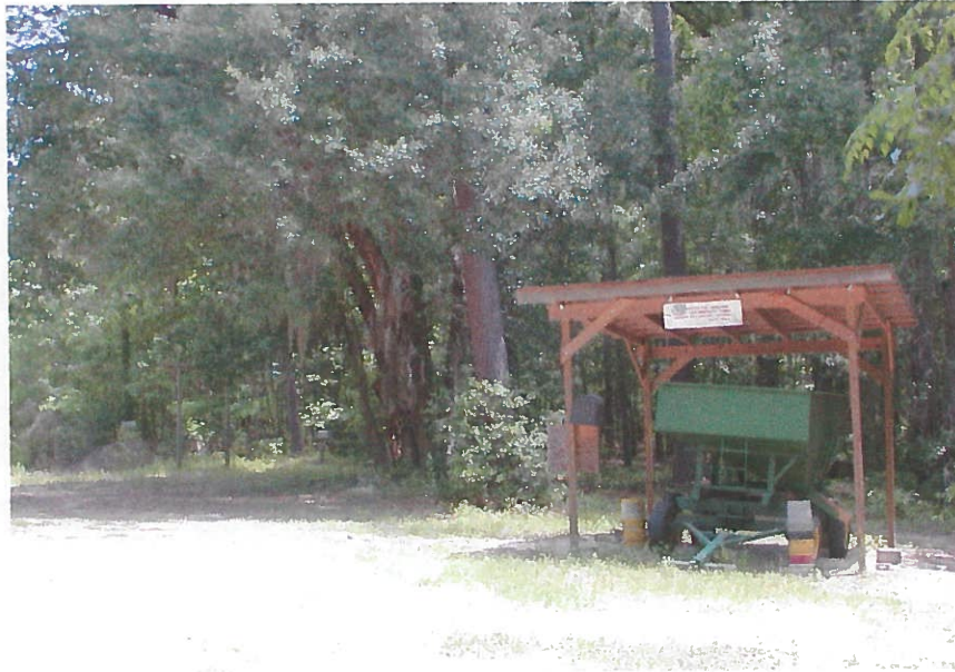
#6. Equipment shed and skinning rack; AZ 94