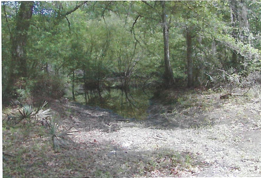
#13. Boat landing on slough near Combahee River; AZ 110 GPS Coordinates: 324473.5/805128.4