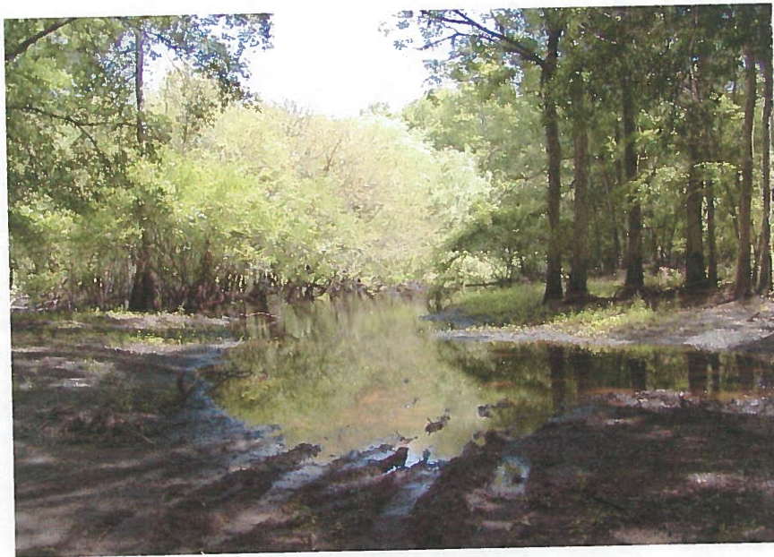
#16. Boat landing near eastern border of tract; AZ 150 GPS Coordinates: 324452.2/805115.4