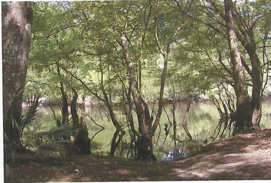
#19. Boat landing near western border of tract; AZ 96