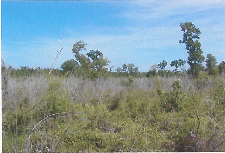
#21. Hardwood clearcut and loblolly pine plantation in background; AZ 140