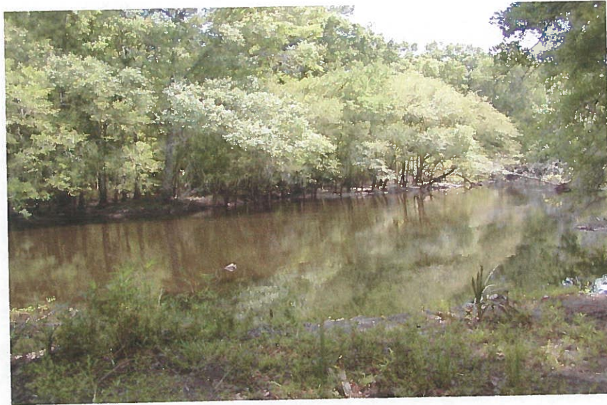
#15. Combahee River near eastern border of tract; AZ 160 GPS Coordinates: 324450.2/805114.9