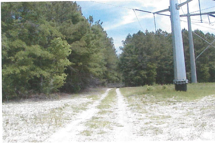
#3. Entrance gate; AZ 80