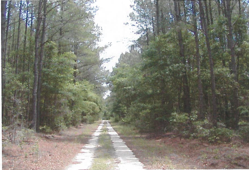
#5. Entrance road; AZ 80