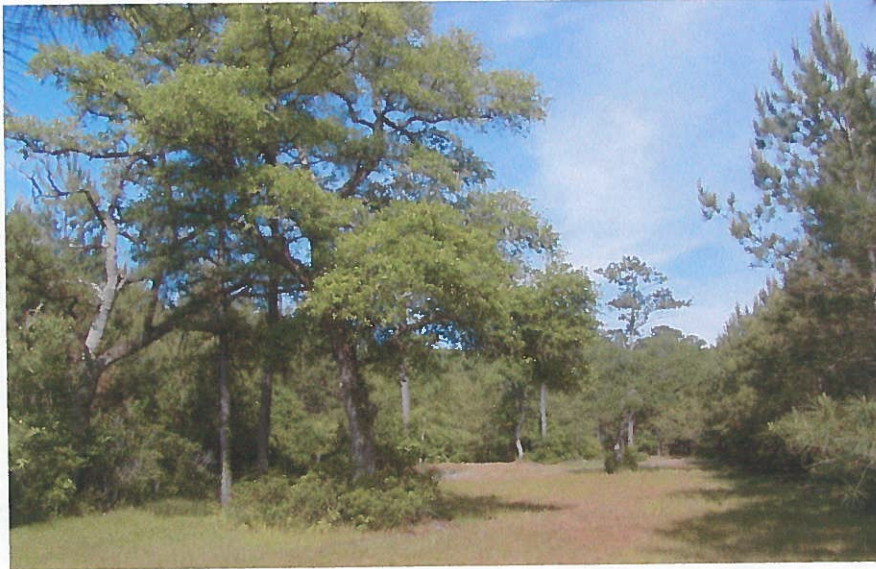
#25. New Road Field with live oaks; AZ 100 GPS Coordinates: 324379.4/805171.8