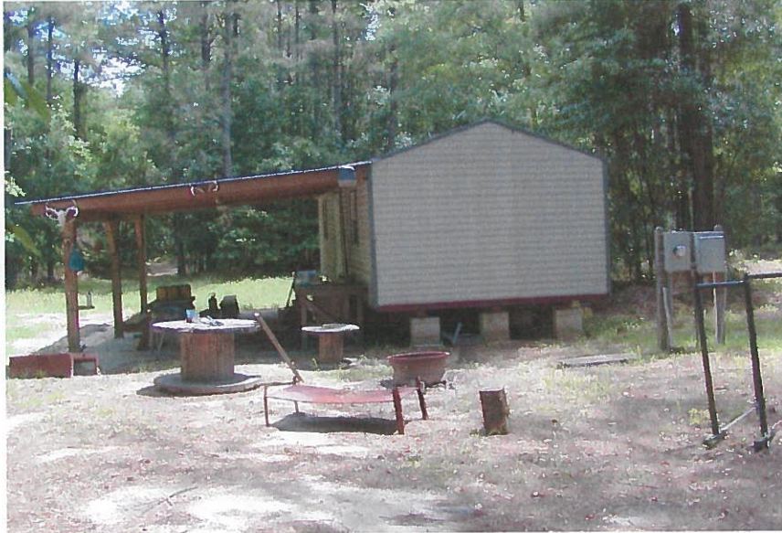
#9. Camp; AZ 110