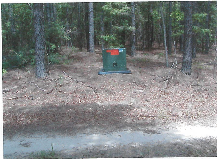
#4. Electrical service inside entrance gate; AZ Due North