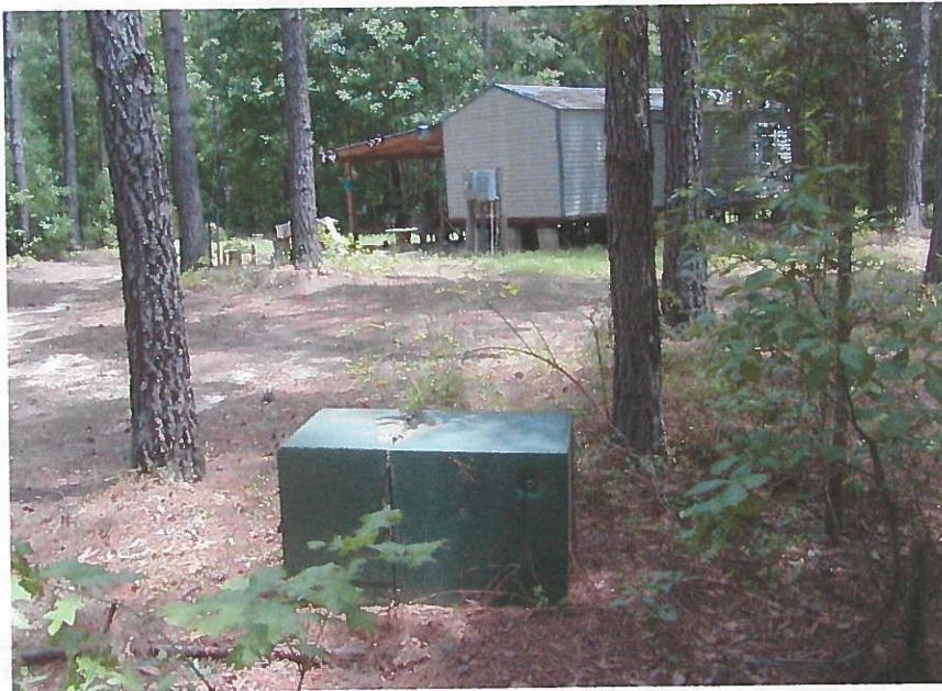
#8. Electrical service at camp; AZ 56 GPS Coordinates: 324389.3/805248.4