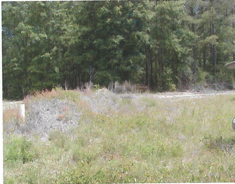
#2. Obscure fire lane in woods along western border of tract; AZ 45 GPS Coordinates: 324382.5/805277.6

Owner DAI ACE Basin: Upper Combahee River (Plum Creek 6)