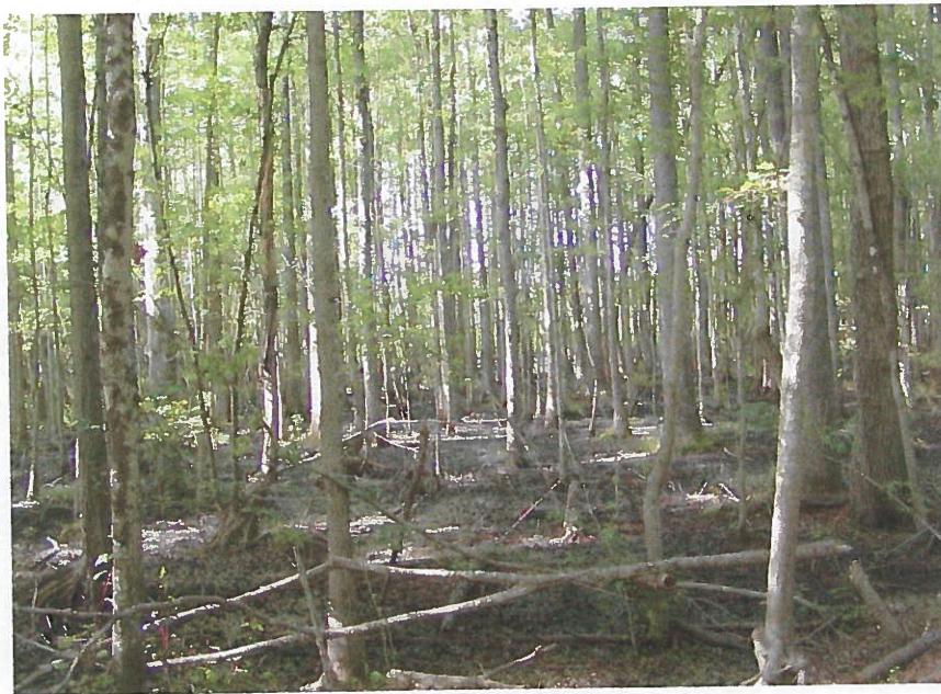
#26. Hardwood drain bordering hillside; AZ 10 GPS Coordinates: 324388.0/805238.1