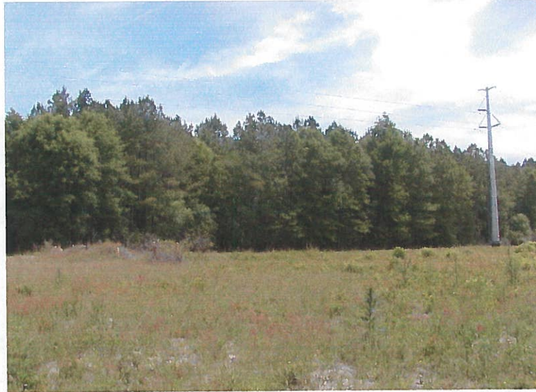
#1. Southwest corner of tract along powerline right-of-way; AZ 80 GPS Coordinates: 324381.8/805280.0