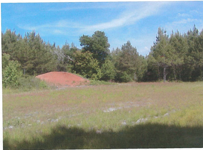
#24. Sawdust Pile wildlife opening; AZ 120