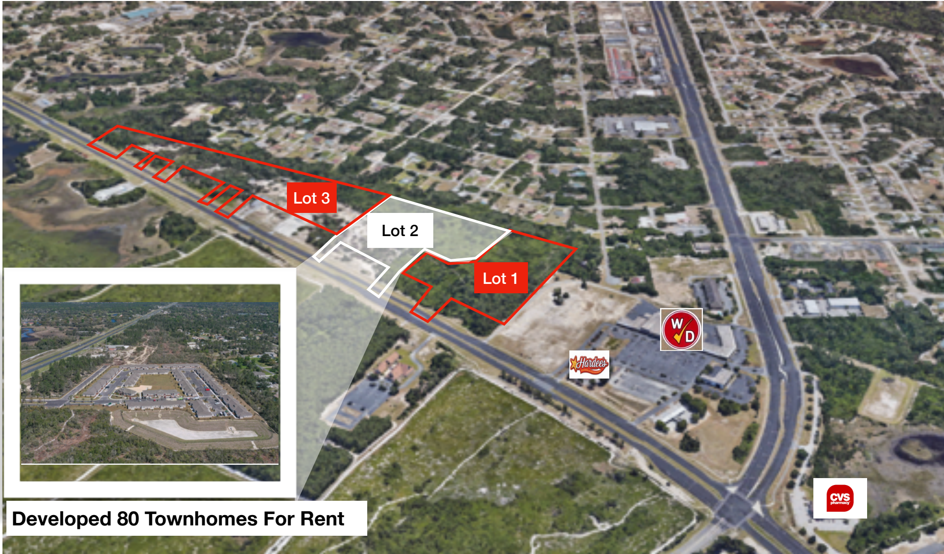
Developed 80 Townhomes For Rent

Lot 1 Price: $1,500,000 Lot Size: 12.07 acres Zoned: PDP-Multi-Family / Townhomes Access: US 19 & Lot 2 frontage Road Utilities: County Water & Sewer