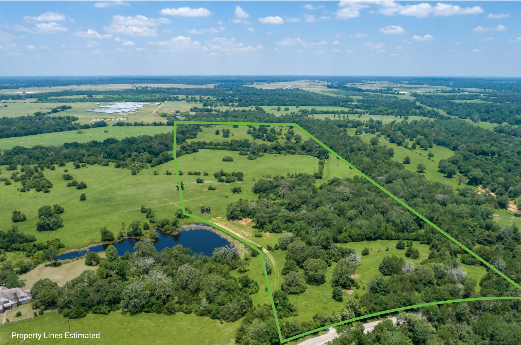
Property Lines Estimated