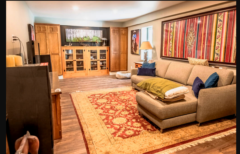
MAIN FAMILY ROOM