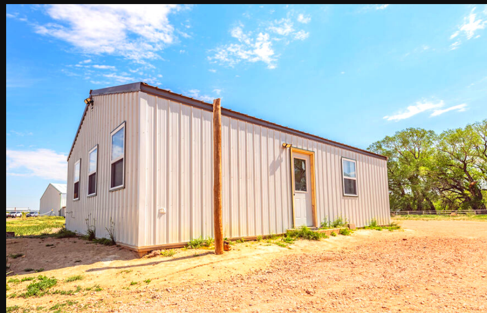
MANAGER'S HOUSE/RENTAL 728SF