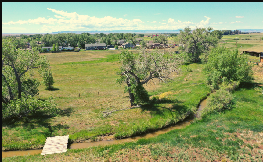
TWO OPEN PASTURES