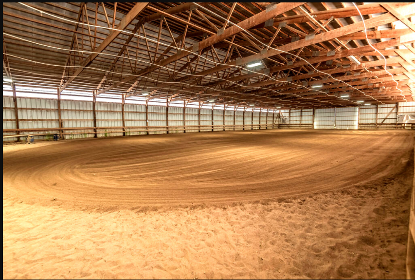
14,000 SF INDOOR RIDING ARENA