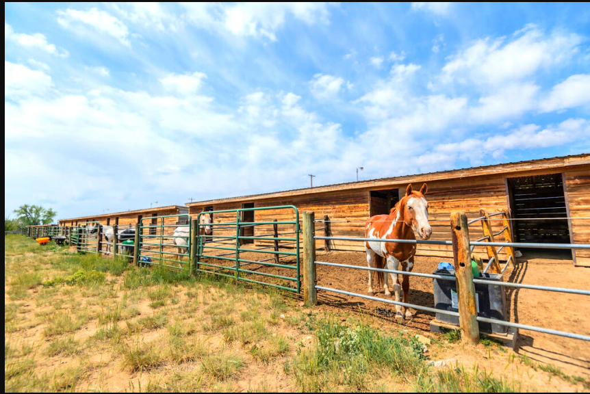
24 OUTDOOR STALLS