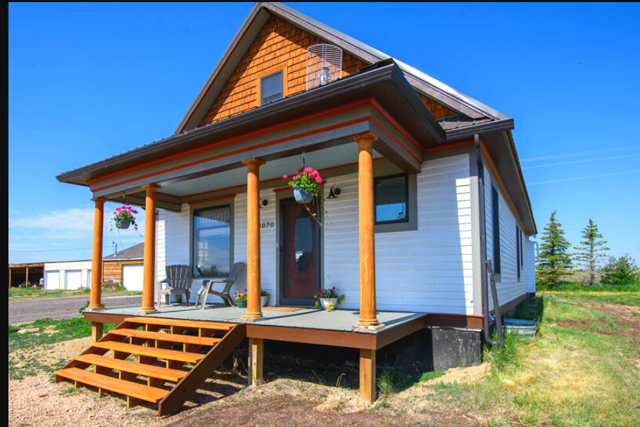
MAIN RANCH HOUSE 3100 SF