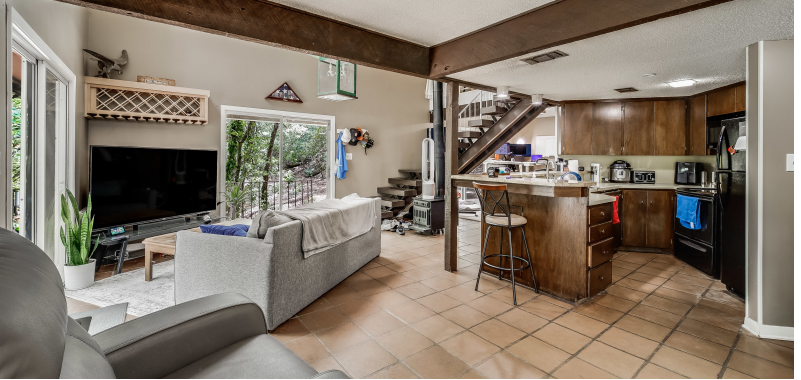
2 BEDS - 2 BATHS - 1,472 SQFT ON 1.08 ACRES