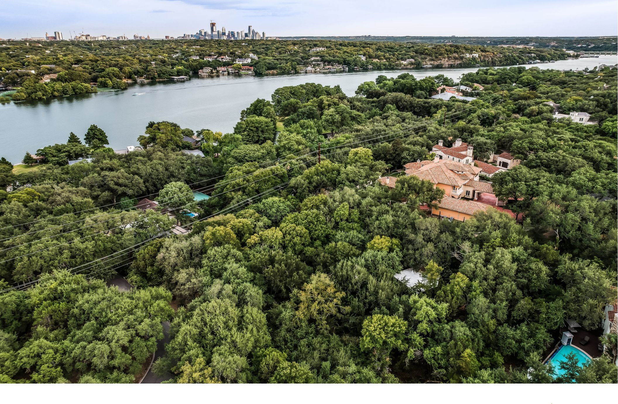
2934/2938 WESTLAKE CV