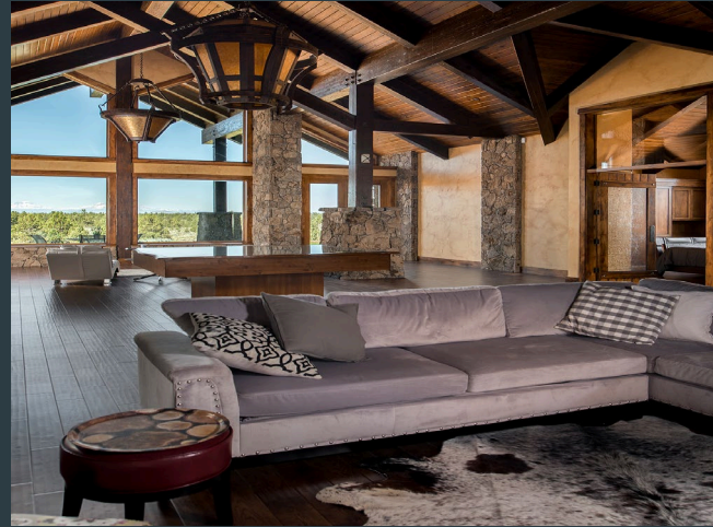
4,384 sq ft Sales Office/Ranch Managers Office