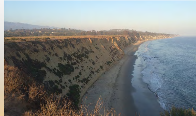
The More Mesa Loop Trail

The South Coast region's central location, year-round mild climate, proximity to the University of California, Santa Barbara (UCSB), high quality of living, bustling technology industry and wealth of outdoor amenities are but a few of the reasons Santa Barbara and Goleta are regularly selected among the best places to live and work by numerous sources including livability.com, Money Magazine and Sunset Magazine.