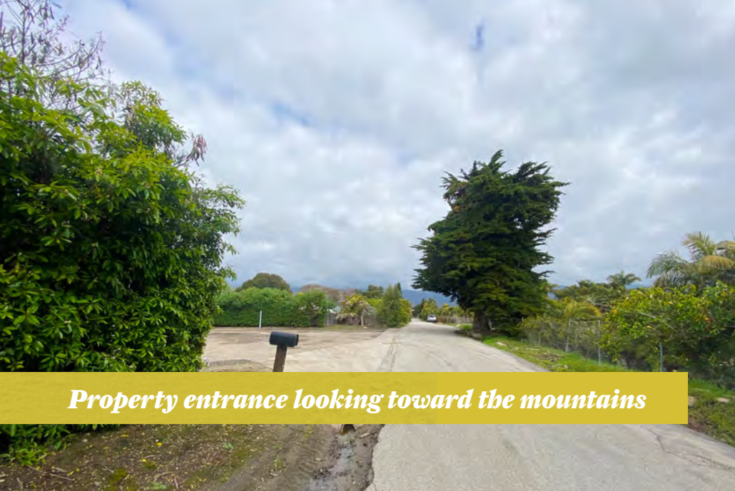
Property entrance looking toward the mountains