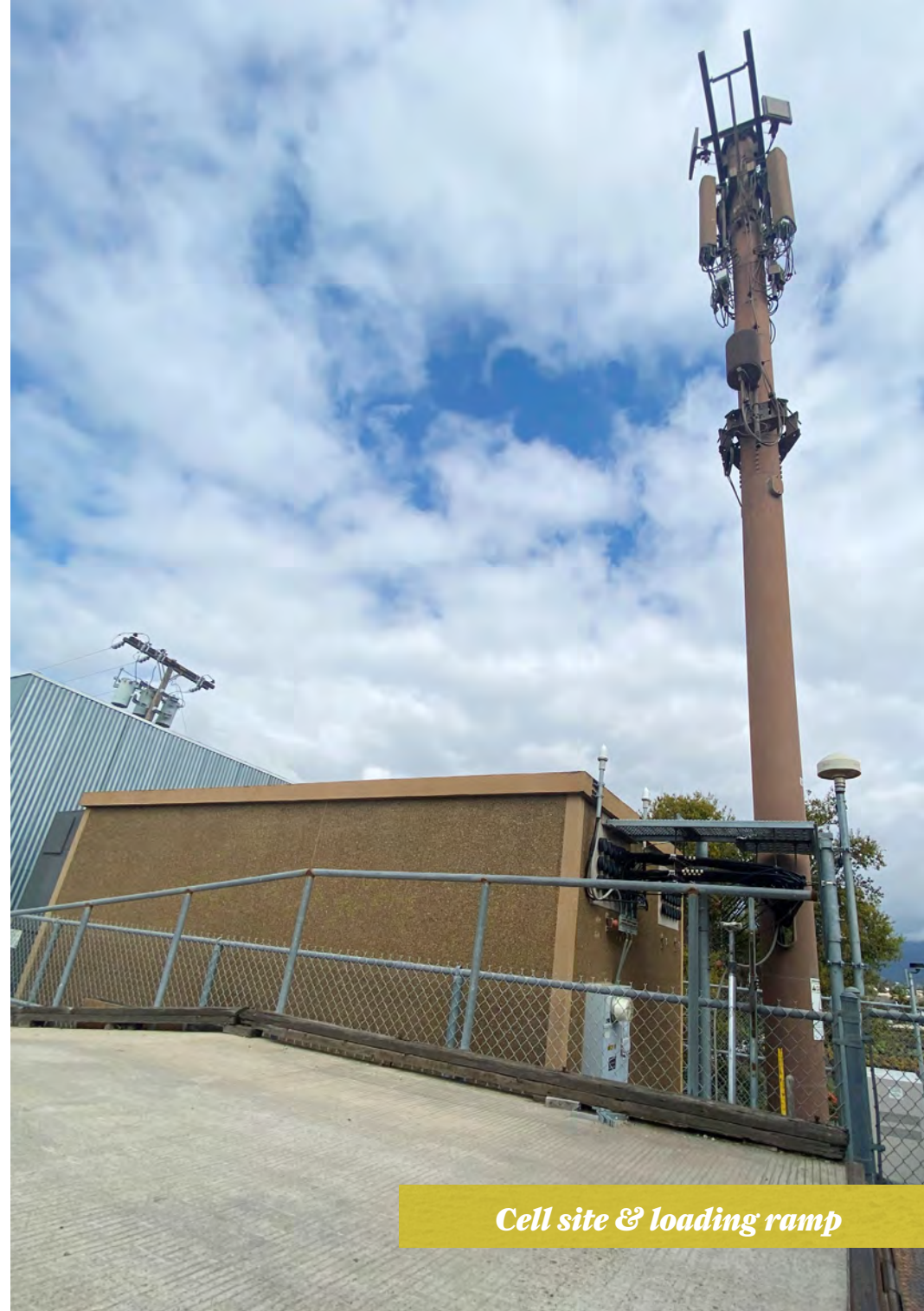
Cell site & loading ramp