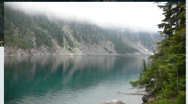
Lake by Auction Property

SEALED BIDS DUE NO LATER THAN 5:00 PM, AUGUST 9, 2023