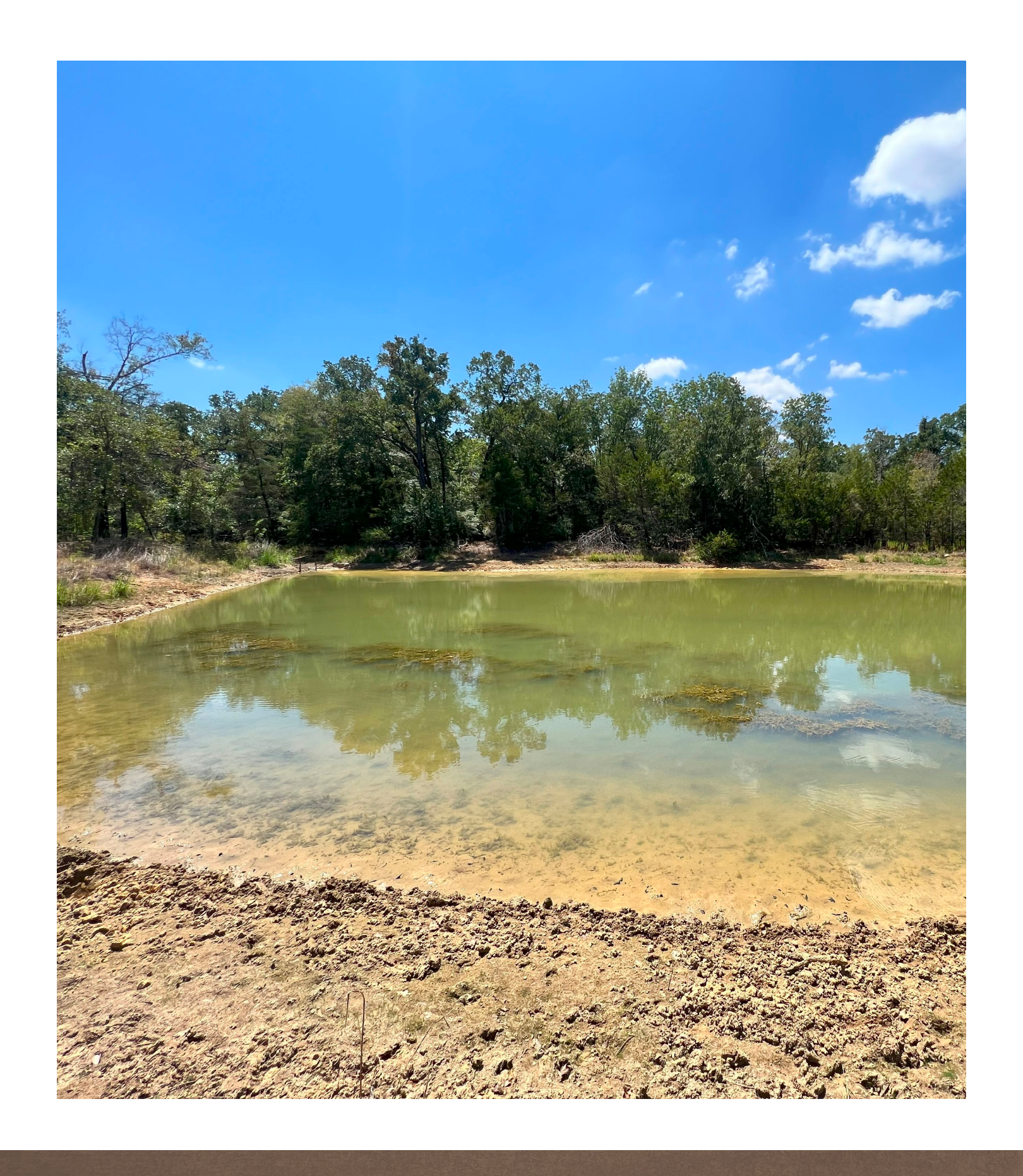
45± Acres Robertson County