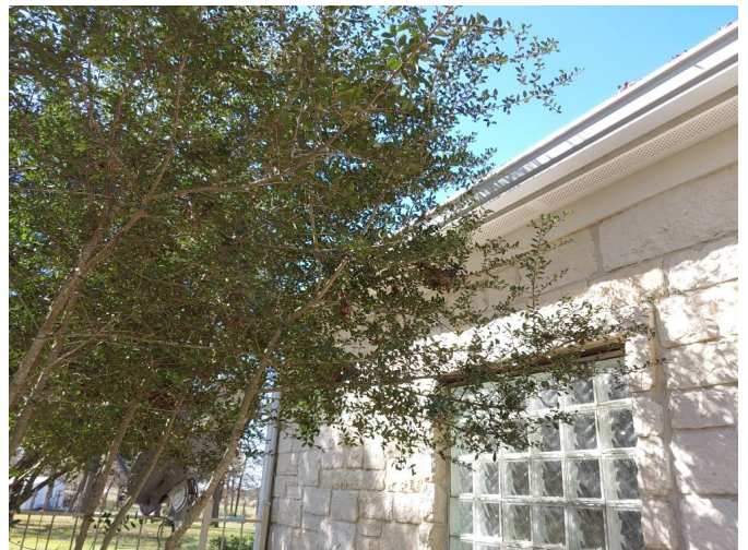
N. Heavy foliage