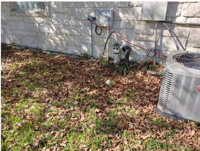
L. Ground High on slab