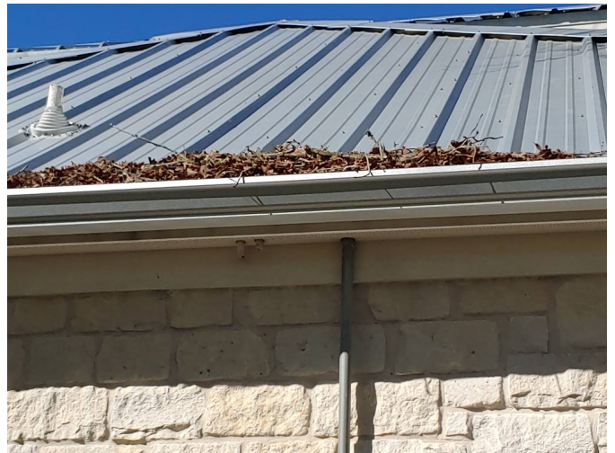
K. Debris on roof & gutters