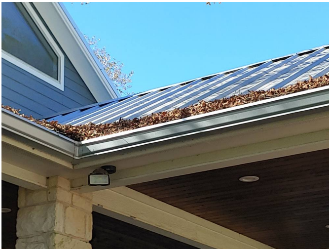
K. Debris on roof & gutters