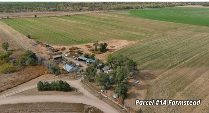
Parcel #1A Farmstead

Farmstead; older home & several outbuildings with well/septic 83.0± total ac; 70.0± ac flood irr; 13.0± farmstead, grass/rds Address: 17987 Co Rd 370, Sterling, CO Legal: S½SE¼ of Sec 36, T9N, R52W Water Rights: 2 shares of Farmer's Ditch, 3 shares of Bravo Ditch; Irr. well augmented by Lower Logan Well Users R/E taxes: $1,517.16 (2022)