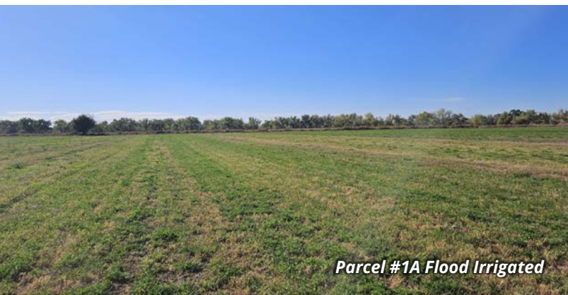
Parcel #1A Flood Irrigated