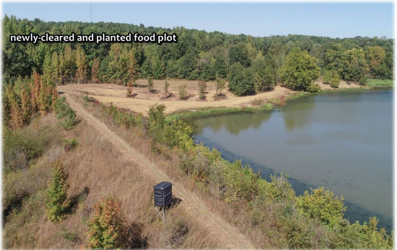
newly-cleared and planted food plot