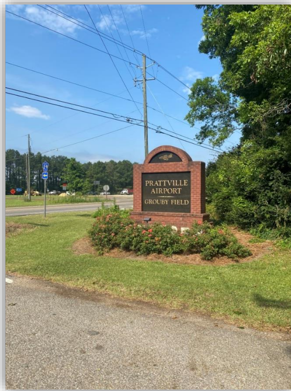
Entrance to Grouby Airport Rd