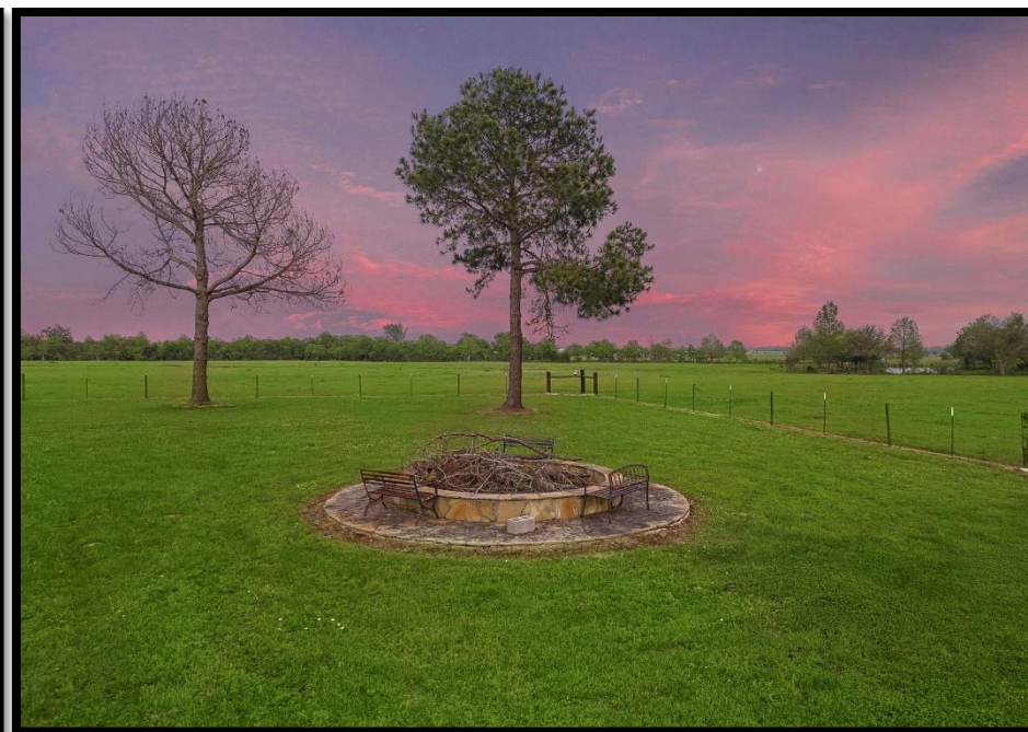
Fire Pit Next to House

For Additional Information Contact: Beau Harris / 936-441-2610 (O) 936-523-0483 (C) / Beau@BlackLabelCommercial.com