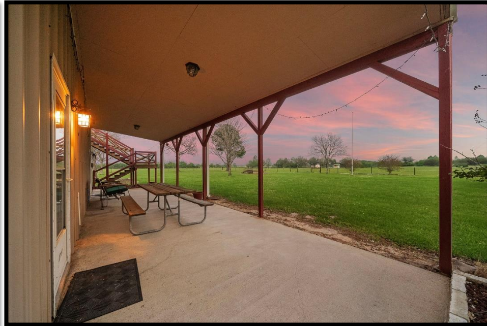
South Covered Porch

For Additional Information Contact: Beau Harris / 936-441-2610 (O) 936-523-0483 (C) / Beau@BlackLabelCommercial.com