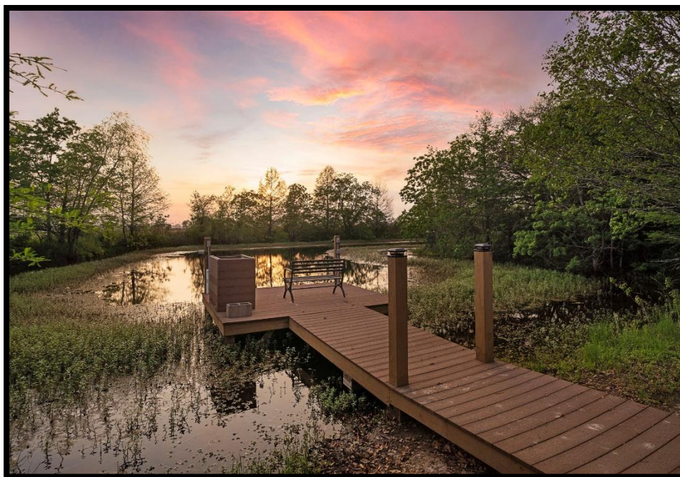
1 Acre Fishing Pond Next to House