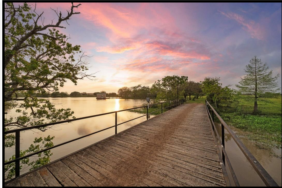
Bridge Over Main Lake

For Additional Information Contact: Beau Harris / 936-441-2610 (O) 936-523-0483 (C) / Beau@BlackLabelCommercial.com