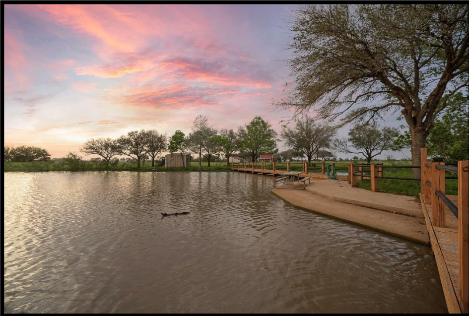
Main Lake Sitting Area