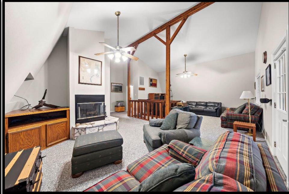
2 nd Floor Family Room

For Additional Information Contact: Beau Harris / 936-441-2610 (O) 936-523-0483 (C) / Beau@BlackLabelCommercial.com