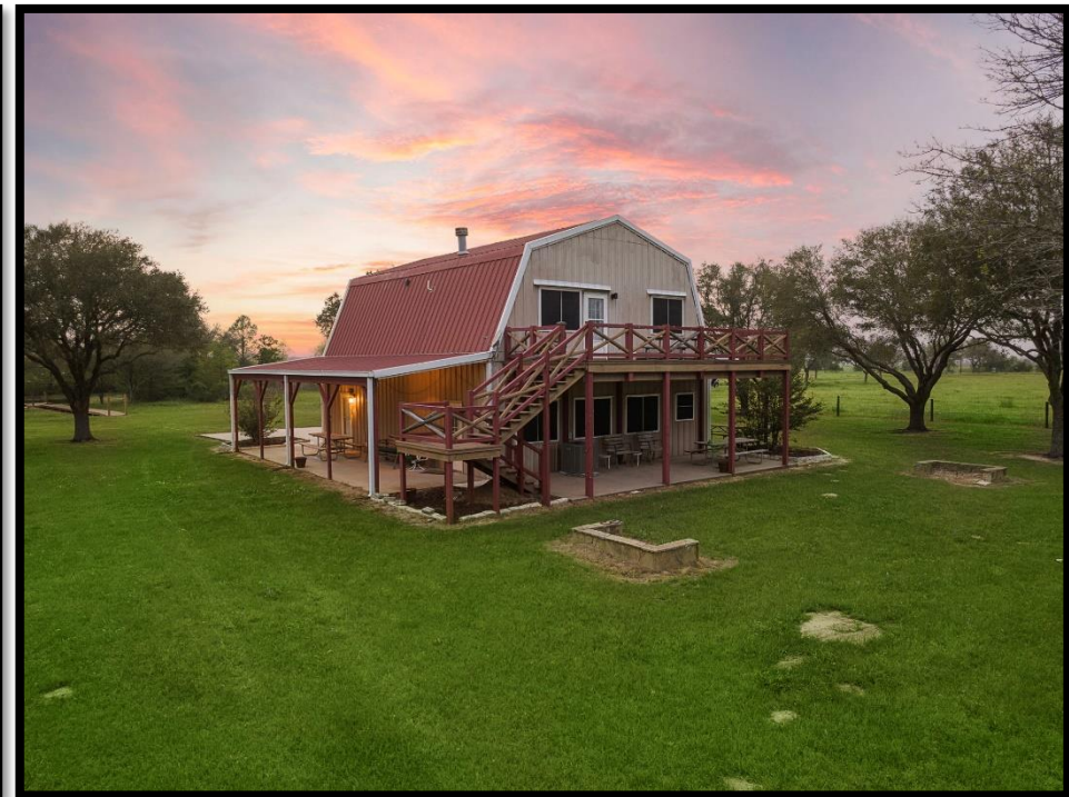
Skeet Shooting Range / View of Home From Skeet Shooting Station

For Additional Information Contact: Beau Harris / 936-441-2610 (O) 936-523-0483 (C) / Beau@BlackLabelCommercial.com