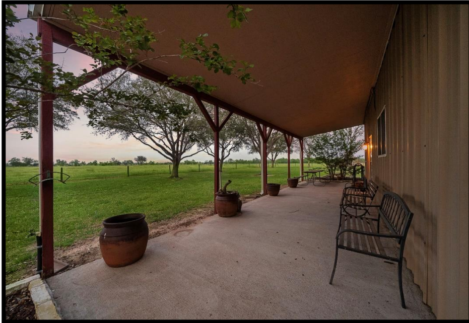
North Covered Porch