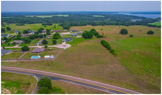
Views of Lot 4—Above