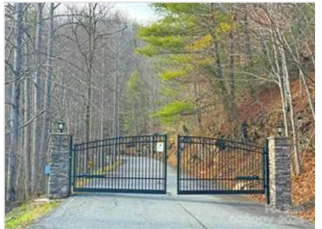
Private gated entrance