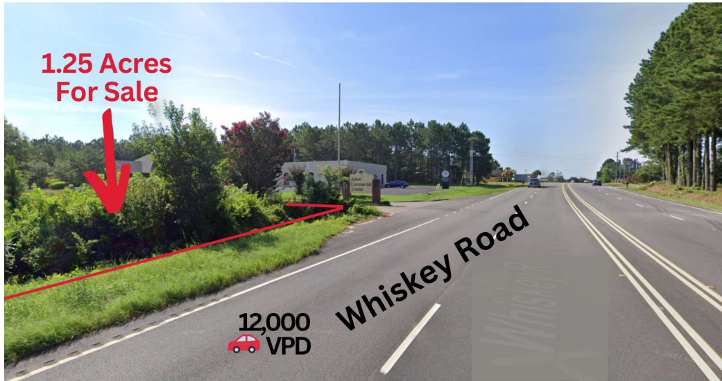
Whiskey Road @ Darlington Drive View to the South