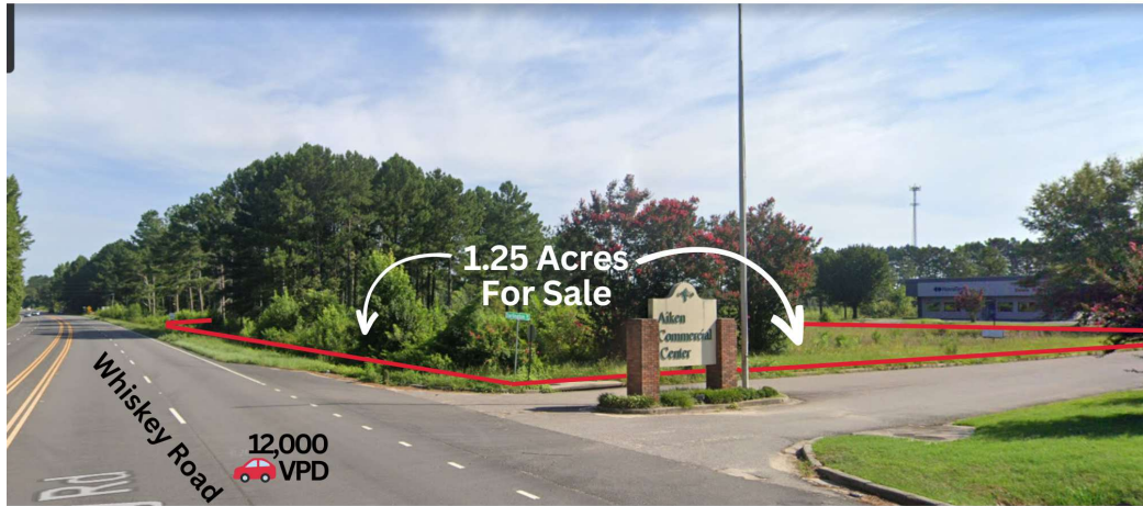
Darlington Drive @ Whiskey Road View to the North