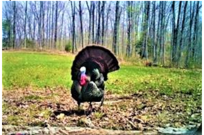
Clover Fields Attract Turkeys and make for Good Hunting

There are other nice features allowed by Tennessee hunting regulations for landowners hunting on their own property. Landowners do not need hunting licenses nor do they need to wear hunter orange or pink. There are certain relatives that are included and you do not need to live on the land for this advantage.