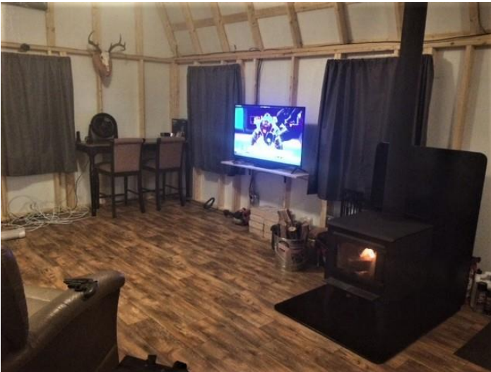
Group Area on Main Level of Cabin