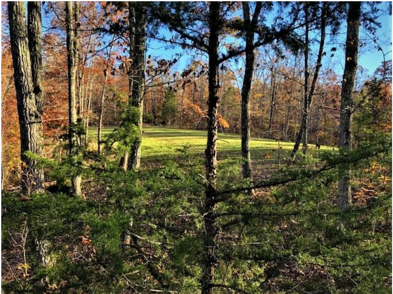
Fall is a Great Time to be Outdoors

Patrey Branch is a turn-key hunting property. There are always new improvements that owners want but these improvements will not be time sensitive so the new owner can begin to enjoy the property while taking their time to make improvements. It is difficult to find properties like this with substantial acreage and ready to go condition.