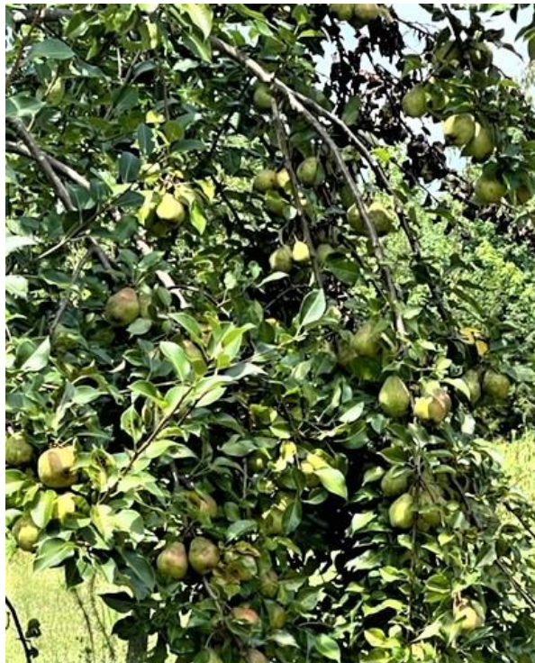
Bell shaped pears make good eating for people and deer

The second strategy is to plant edge type trees near deer stands or tower stands. Trees used for this are: