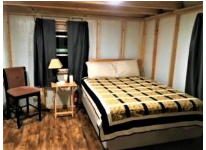
Separate Bedroom with Queen Size Bed