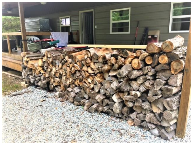
Any firewood remaining will be included