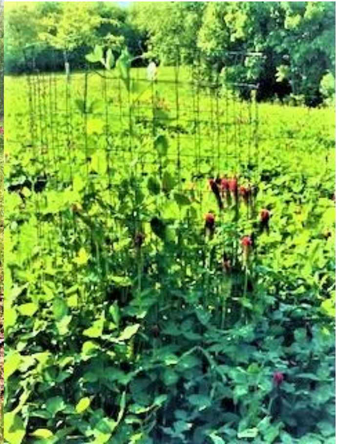
Same cage after Spring Greenup – Will die back in late May to early June. Summer annuals are planted between the Middle of May and Memorial Day.