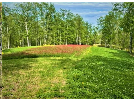
Typical of property plantings with annuals on level parts of fields and clover (perennials) on gentle slopes