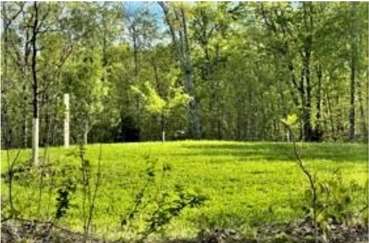
Clover Plot with Wildlife Fruit Trees bearing from September through December

From Franklin, take Highway 96 to Highway 100 through Fairview and continue to I-40 West and follow the directions as noted on “From Nashville.”