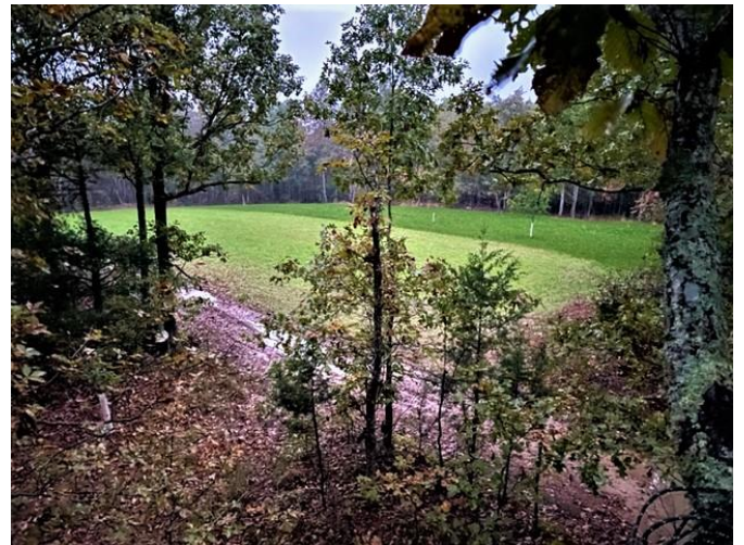
View from a ladder stand, Annual Food Plot in Front and Perennial Clover Plot in back with fruit trees & Chestnut Trees planted around the deer stand

A copy of the most recent food plot plan is included later in this property presentation. The pH and soil fertility has been substantially improved. Before each planting, soil samples are taken and sent to a high-quality private lab for testing. Then a plan is formulated to meet the nutrition needs of the plants being planted. This includes a fertilizer that is specially formulated for wildlife food plots to ultimately supply the deer with the nutrients needed for maximizing antler growth, lactation of does and health of the newborn fawns. The size of the buck racks has increased in the last few years on this property as these food plots provide the protein and nutrition that the bucks need to maximize their genetic potential.