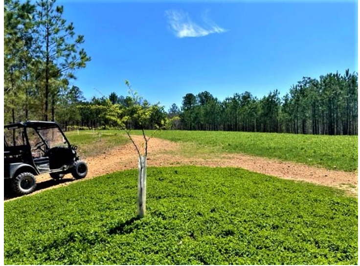
Intersection Field of Perennial Clover, Plum Tree, and an Annual Food Plot