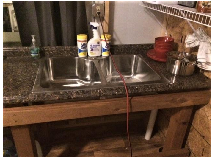
Sink Area - Provides a great spot to prepare lunches