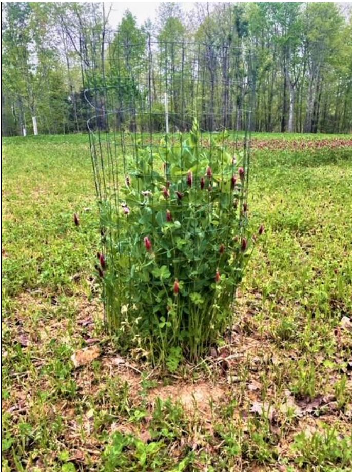
Exclusion Cage Showing Huge Amount of Deer Browse. Picture taken just as spring green up was starting. This is a winter annual food plot.