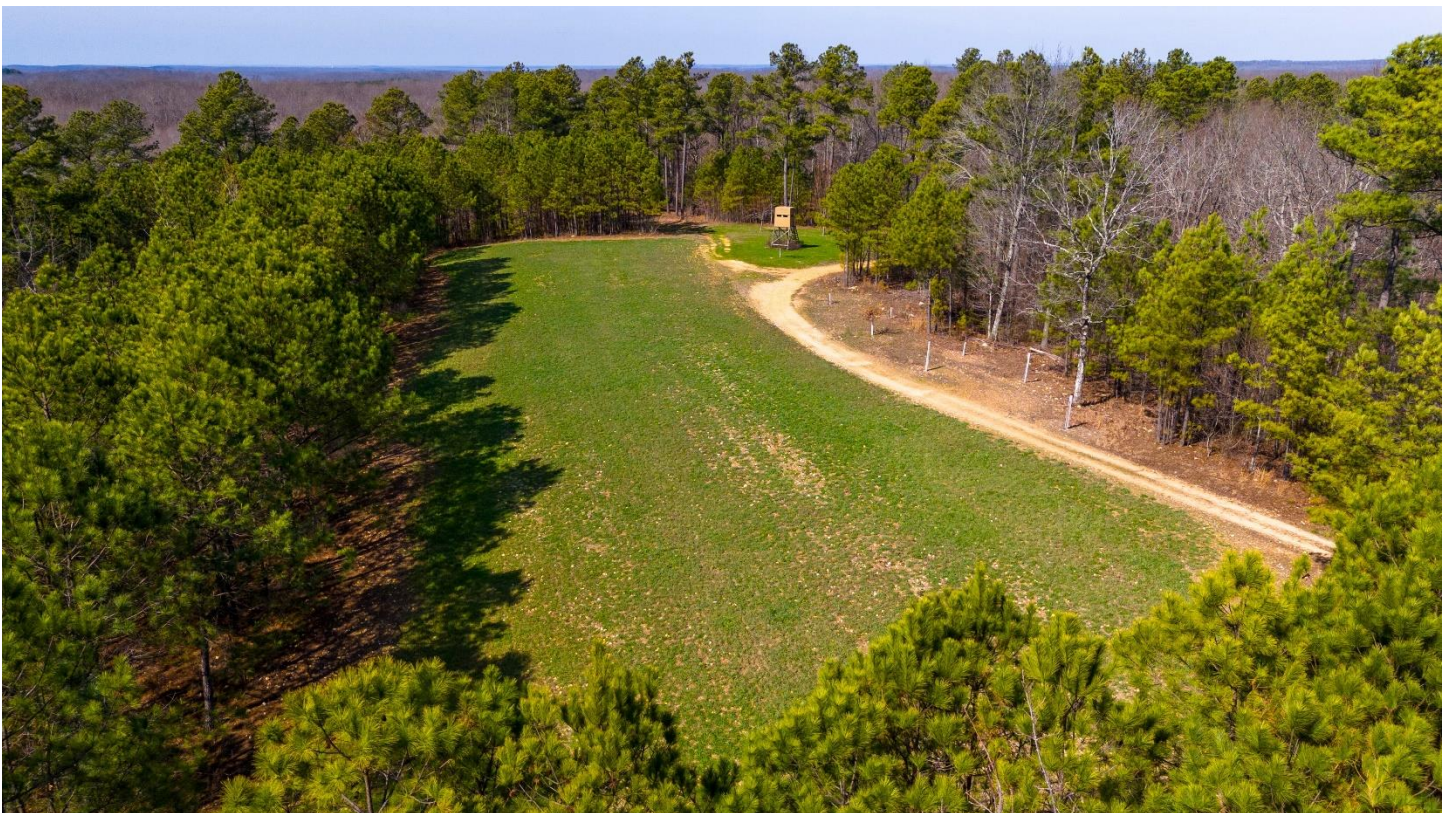
The Other Part of the Two Part Field Showing Shooting House on Small Clover Plot