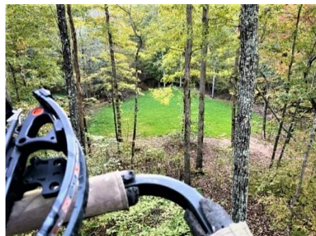
Small Kill Plot Near a Larger Food Plot and water