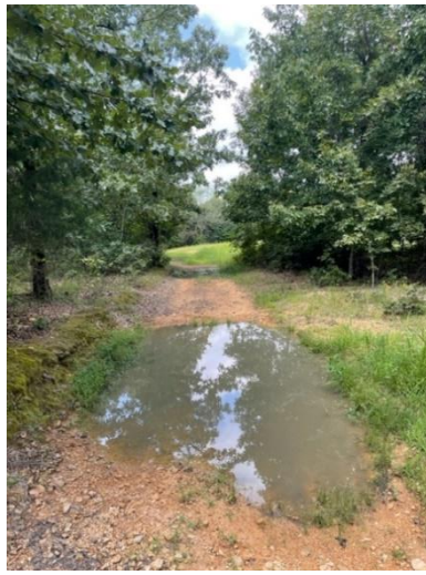
Amazing Perennial Puddle