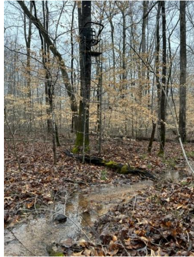
Deer Stand on Spring Creek in Big Draw

After the major flooding of 2010, many of the Middle Tennessee small spring creeks had deposits of cherty rock deposited in them. These deposits are several feet deep in many locations. This has caused many of the streams to go underground and then reappear again later downstream. This phenomenon has probably occurred on this property. This leaves standing water in some locations when rainfall has been low in the area. A nice spring creek comes out of a big draw below some food plots.