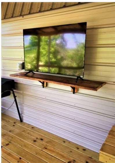
Both TV's have great reception