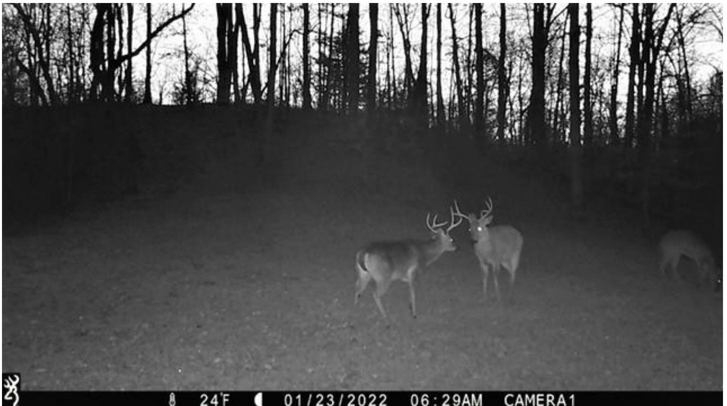
Two heavy weights about to spar at prime time – Should be on Sports Center