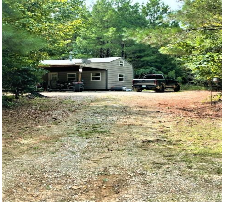
Hunting Cabin near the entry to the Property – Not in Hunting Area. Additional area for barn or another residence close by.

Also included in the sale is a Honda Pioneer Side by Side UTV. This UTV has a rear cargo area that easily converts to two bucket seats to allow a total of 4-5 riders. This conversion system is bombproof.