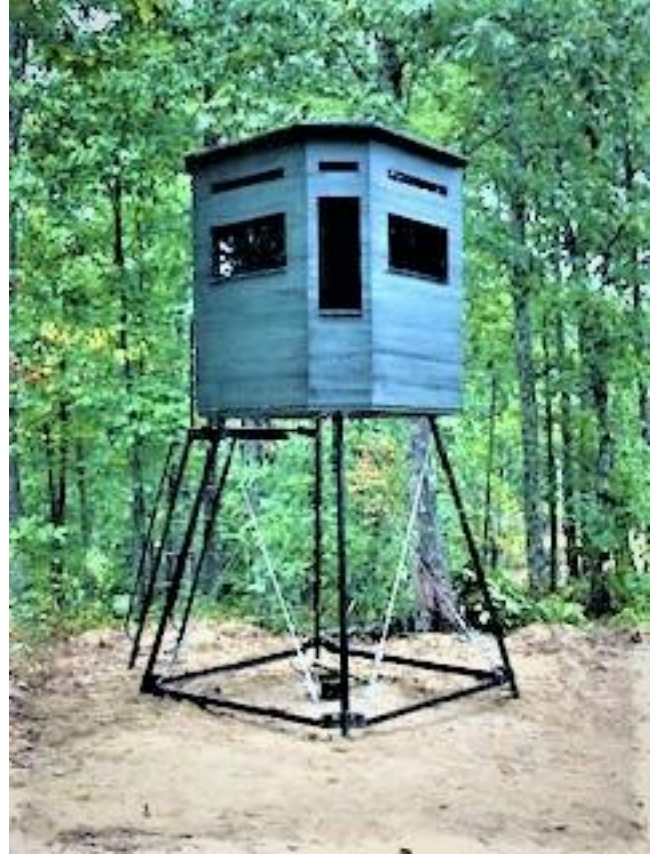
One of two Tower Blinds – Each have 2 swivel seats

Two Tower Blinds are included in the sale of the property. These tower stands have metal steps and hand rails for safety when ascending the ladder. Each of these tower stands have Buddy Propane Gas Heaters that come in handy on those late season hunts. These tower stands are great for taking youth or novice hunters with you on a hunt.