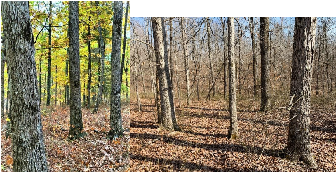
Area of Valuable Oaks (Monetary & Wildlife)