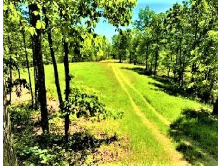
First-time planted food plot. This is the same food plot on previous page at bottom right. The picture on the previous page is after the plot had been planted a few times.