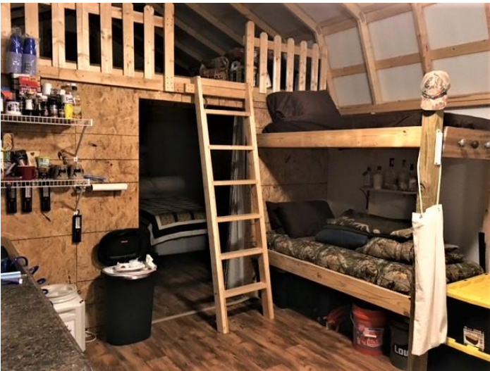
Bunk Bed in Main Area - Queen Bed in Background