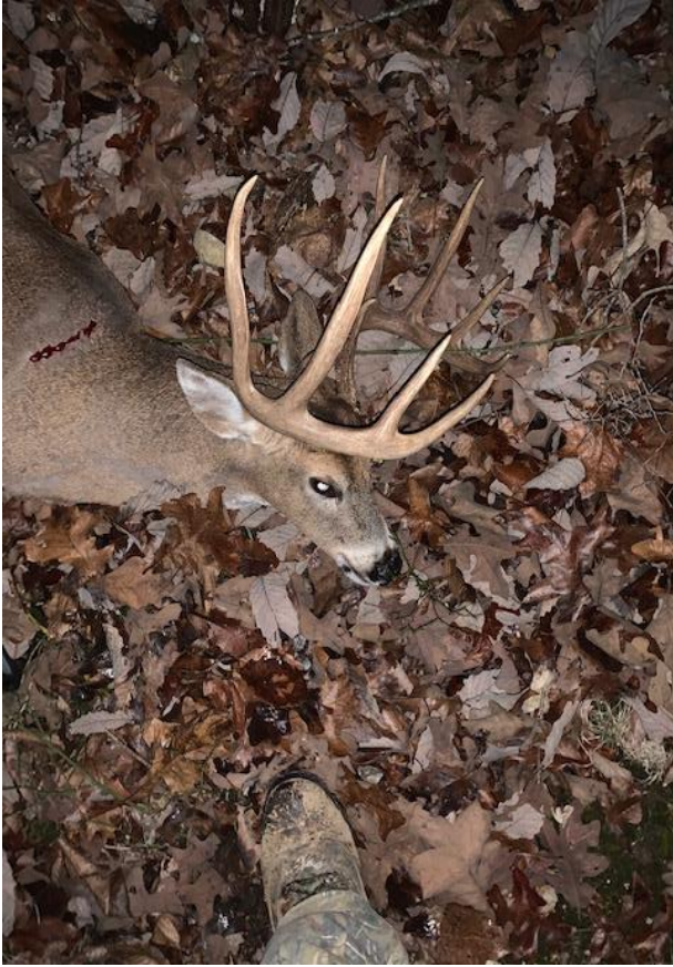
10 Point Buck on the Ground

Deer and turkey hunting is very good on this property. Several mature bucks will be on the property during at least part of the hunting season. The development of a hunting strategy and implementation of the same can maximize the harvest of mature deer. The population base is strong enough to allow youth or first-time shooters to harvest younger bucks. The turkey population has increased as the habitat work has been completed. Several turkeys have been taken each year for the last few years.