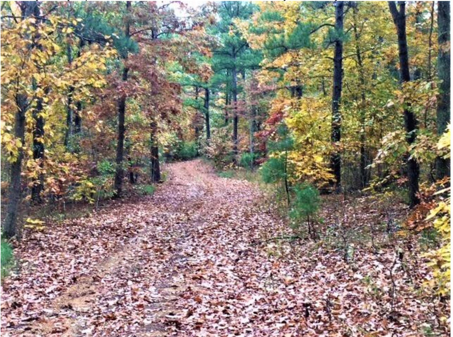
Extensive Trail System Throughout this Property

The Perry County Airport is located near Linden and has a 3600' daytime runway.