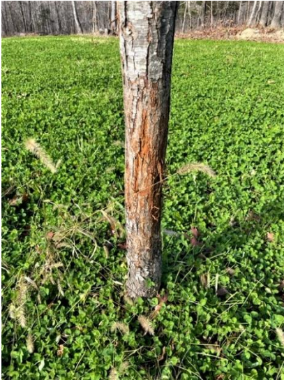
Buck Rub in a Clover Field