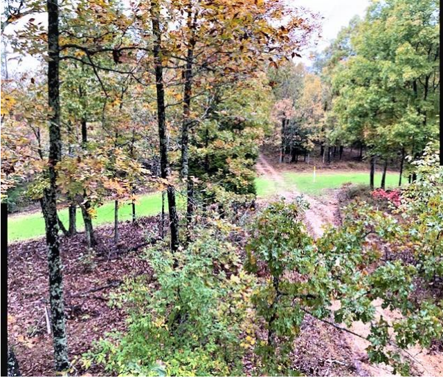
Underground gas line food plot – Great mineral lick nearby