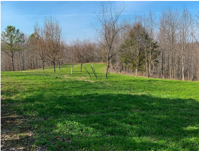
One of the larger food plots

Shortly after the current owner bought this property, he began to clear areas for food plots and improve the trail system on the property. These improvements were completed over time and included the planting of wildlife-oriented fruit and nut bearing trees. This work has been directed by a professional wildlife biologist/soil scientist who has also performed much of the installation work.