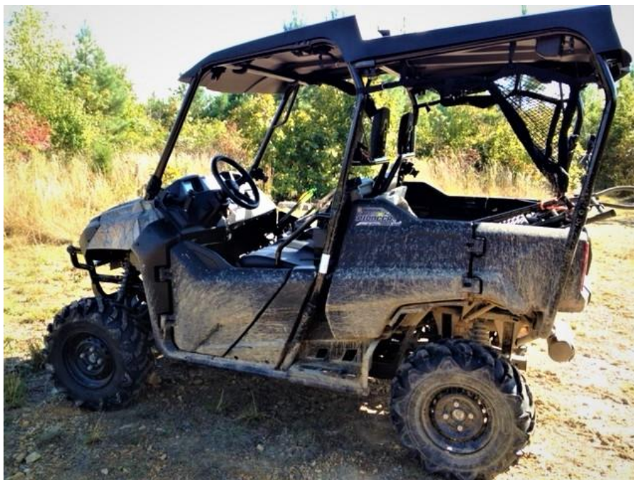
Honda Pioneer on a work day in area clearing up a food plot

Also included in the sale is a Honda Pioneer Side by Side UTV. This UTV has a rear cargo area that easily converts to two bucket seats to allow a total of 4-5 riders. This conversion system is bombproof.