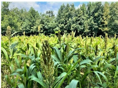
Forage Tech Spring Summer Food Plot Has grain sorghum, Eagle Forage Soybeans summer peas and lab lab

A copy of the most recent food plot plan is included later in this property presentation. The pH and soil fertility has been substantially improved. Before each planting, soil samples are taken and sent to a high-quality private lab for testing. Then a plan is formulated to meet the nutrition needs of the plants being planted. This includes a fertilizer that is specially formulated for wildlife food plots to ultimately supply the deer with the nutrients needed for maximizing antler growth, lactation of does and health of the newborn fawns. The size of the buck racks has increased in the last few years on this property as these food plots provide the protein and nutrition that the bucks need to maximize their genetic potential.