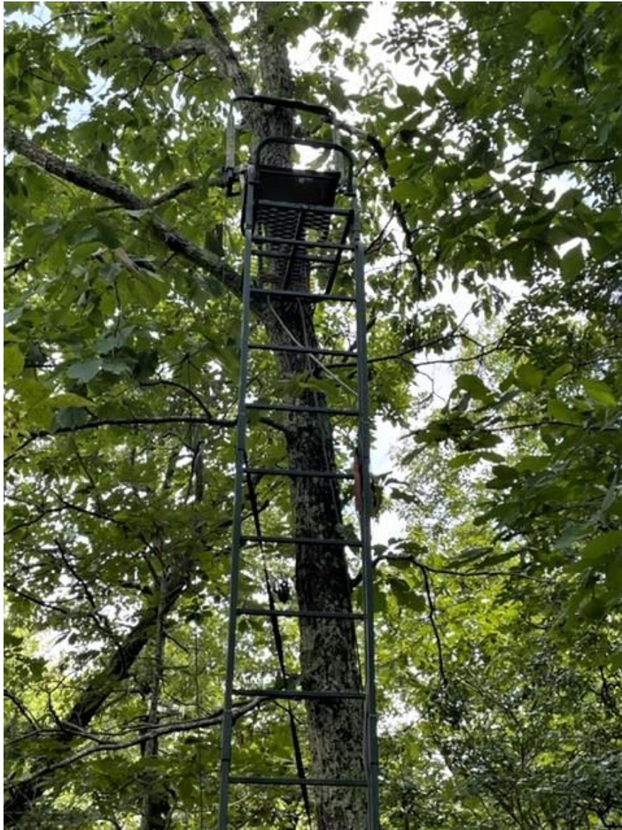
Typical Millennium Brand 21' Ladder Stands