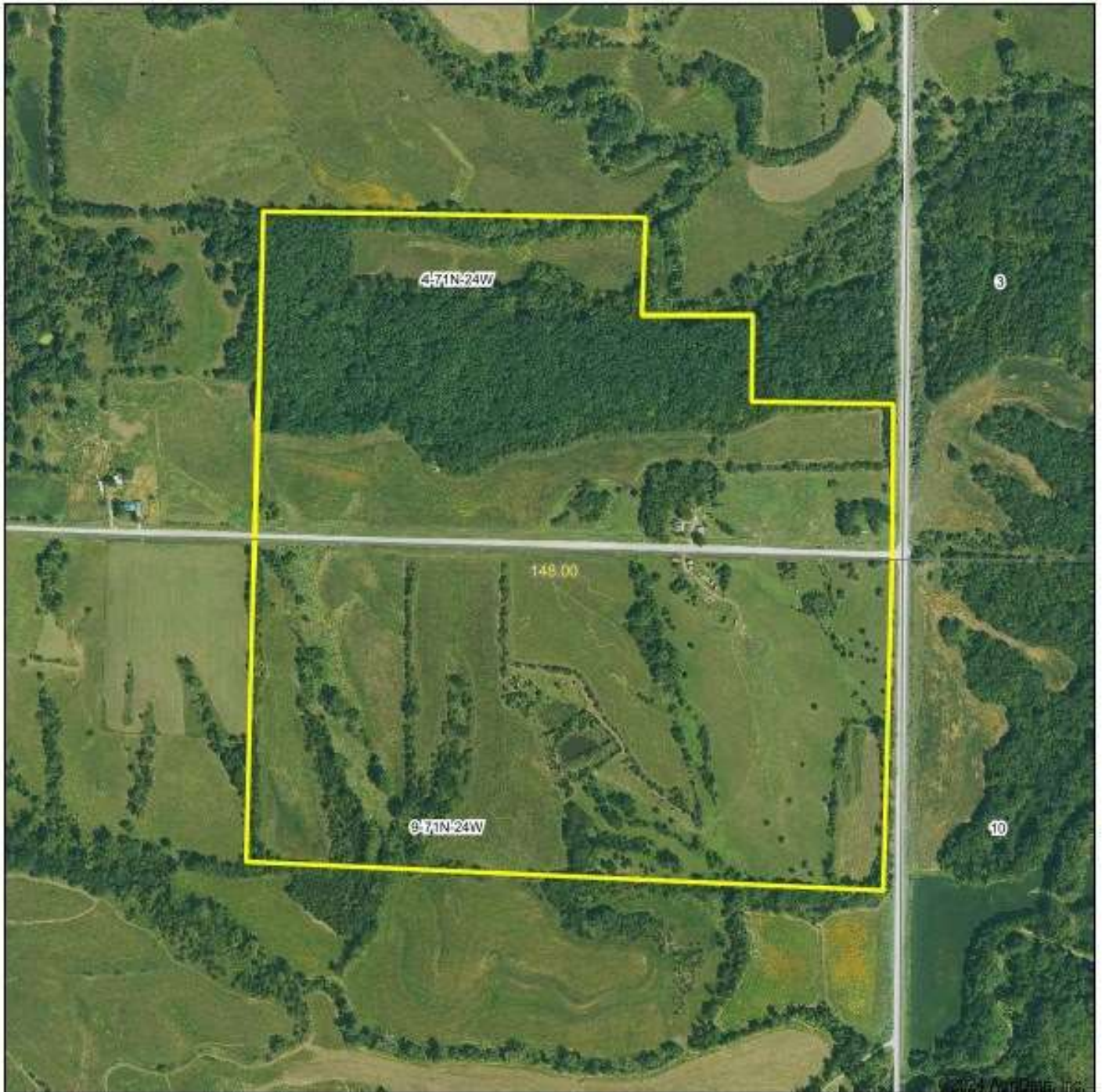
Aerial Map Boundary Lines Are Approximate