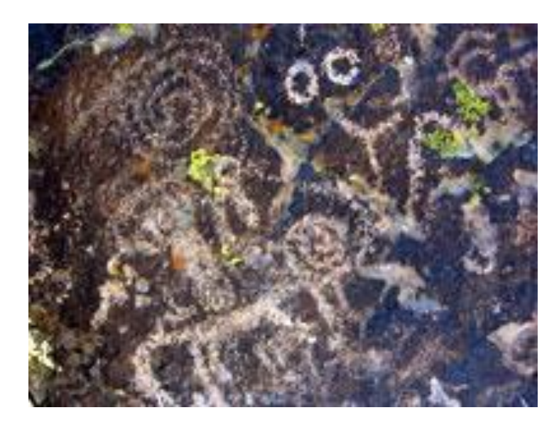
Stop 5: End of the Pavement at the apple orchards at Elgin and Elgin School State Park. (1.9 miles south of Stop 4).