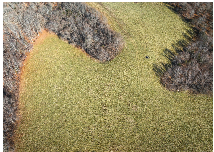
Broker does not guarantee the accuracy of sq. ft., lot size, or other information, buyer is advised to independently verify the accuracy of information through personal inspection and with appropriate professionals