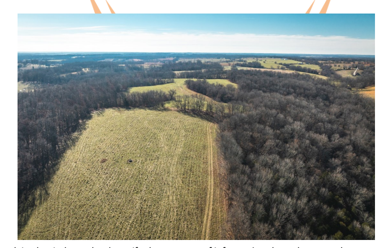
Broker does not guarantee the accuracy of sq. ft., lot size, or other information, buyer is advised to independently verify the accuracy of information through personal inspection and with appropriate professionals