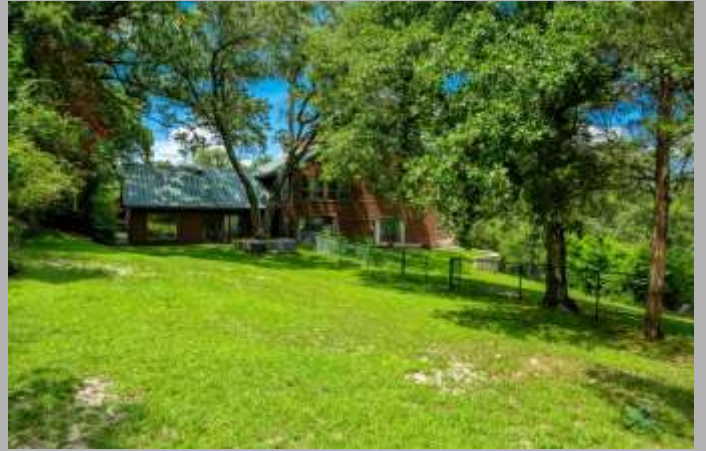
The property features a 30' x 30' shop which offers electricity and water along with a walk-in cooler.