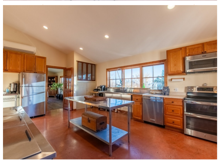
Broker does not guarantee the accuracy of sq. ft., lot size, or other information, buyer is advised to independently verify the accuracy of information through personal inspection and with appropriate professionals