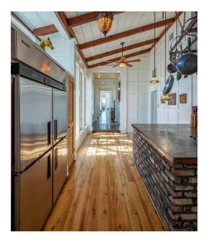
95± Acres Bee County